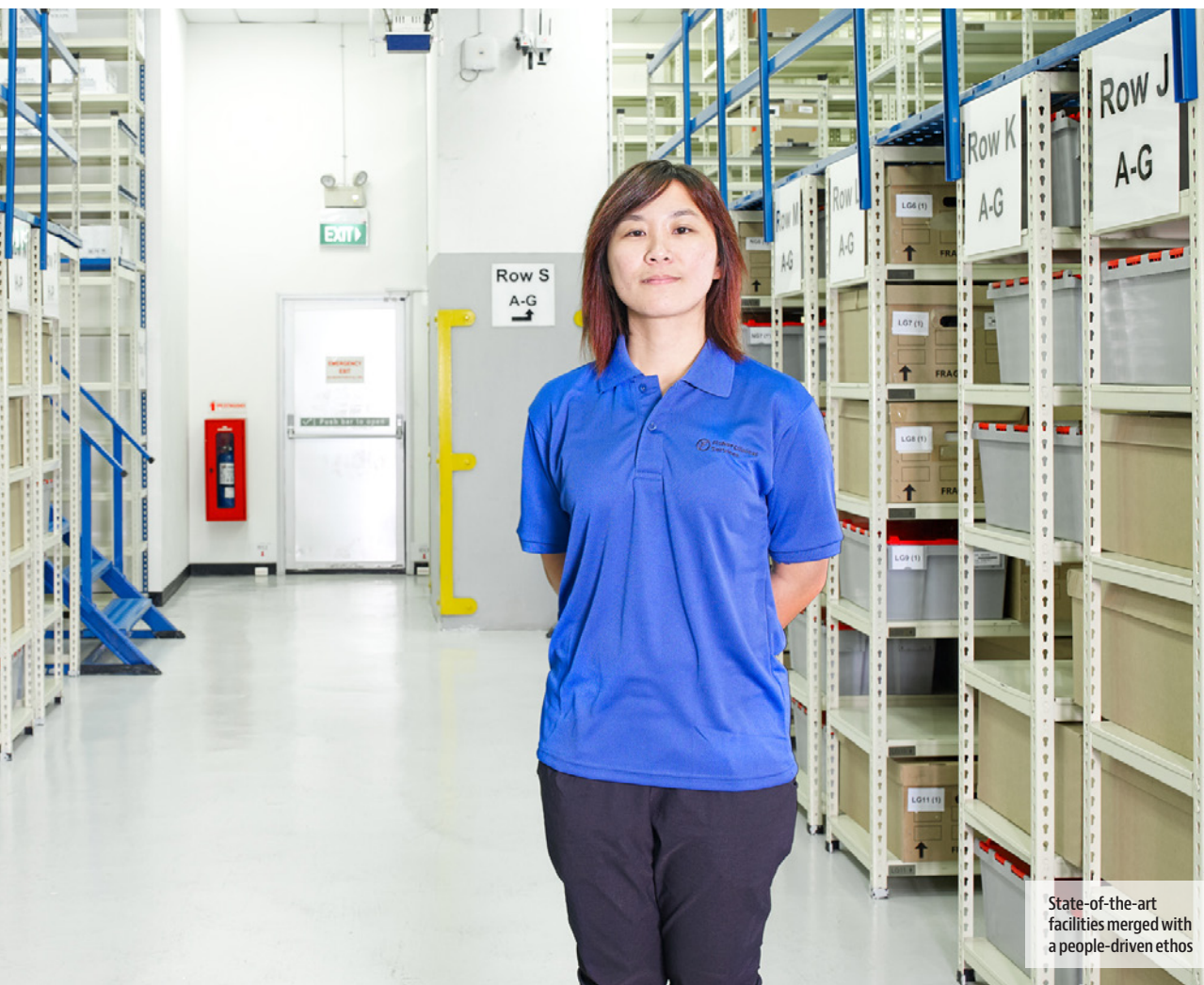
State-of-the-art facilities merged with a people-driven ethos

on experience of what it will be like in a real cGMP environment. Although they technically work for Fisher Clinical Services, there is a definite feeling within the Company that Management work for them. Ensuring that they always have the knowledge, skills and training to carry out their work in a zero failure environment.