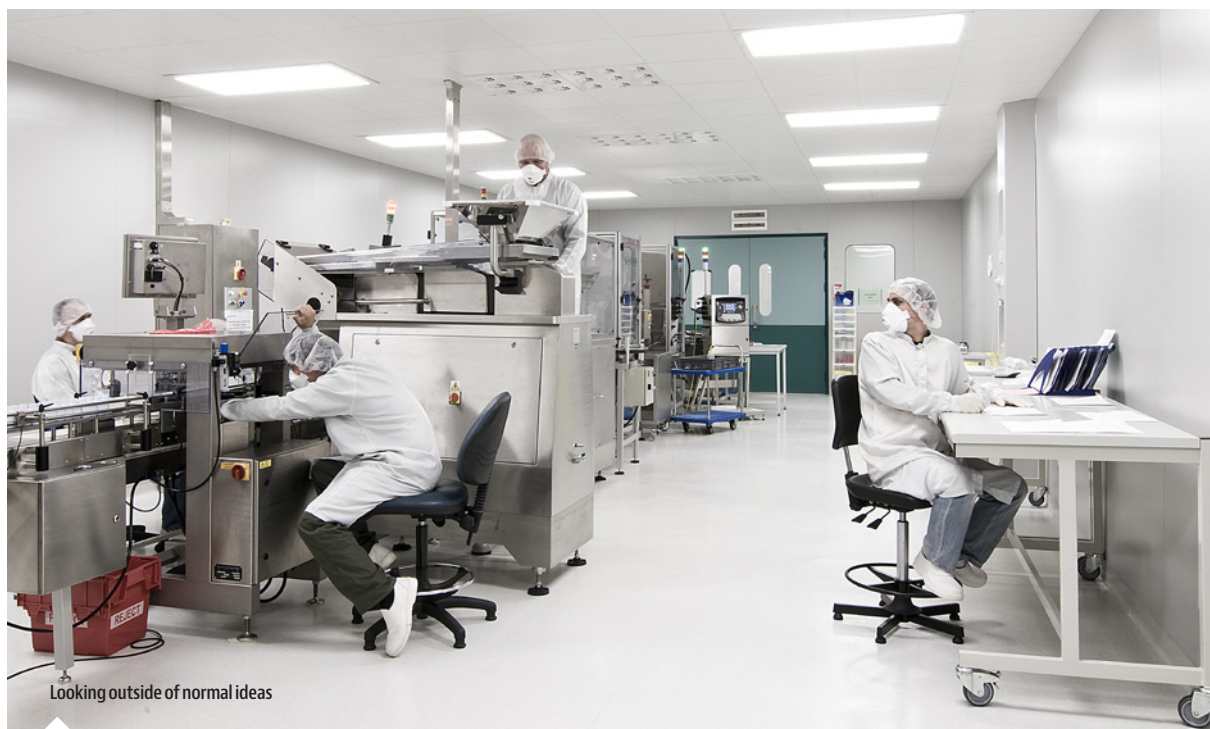
Looking outside of normal ideas

“In 2015 fit out of our cGMP secondary packaging and labeling facility commenced,” adds Bode. “There was further expansion into Unit 4 in 2016 to accommodate cold chain and ambient storage and distribution requirements and office expansion.”